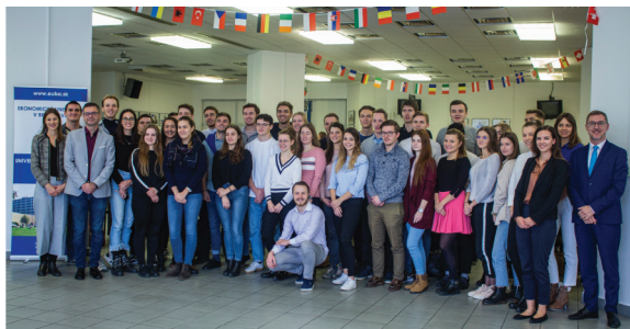
2 nd cohort - Bratislava Course Week