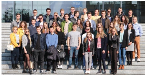
1 st cohort - Bratislava Course Week